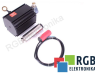
RB-220-07A R C&K

New C&K RB-220-07A R Tested and cleaned. 12 months guarantee Dedicated courier Delivery across Europe even in 2-3 working days